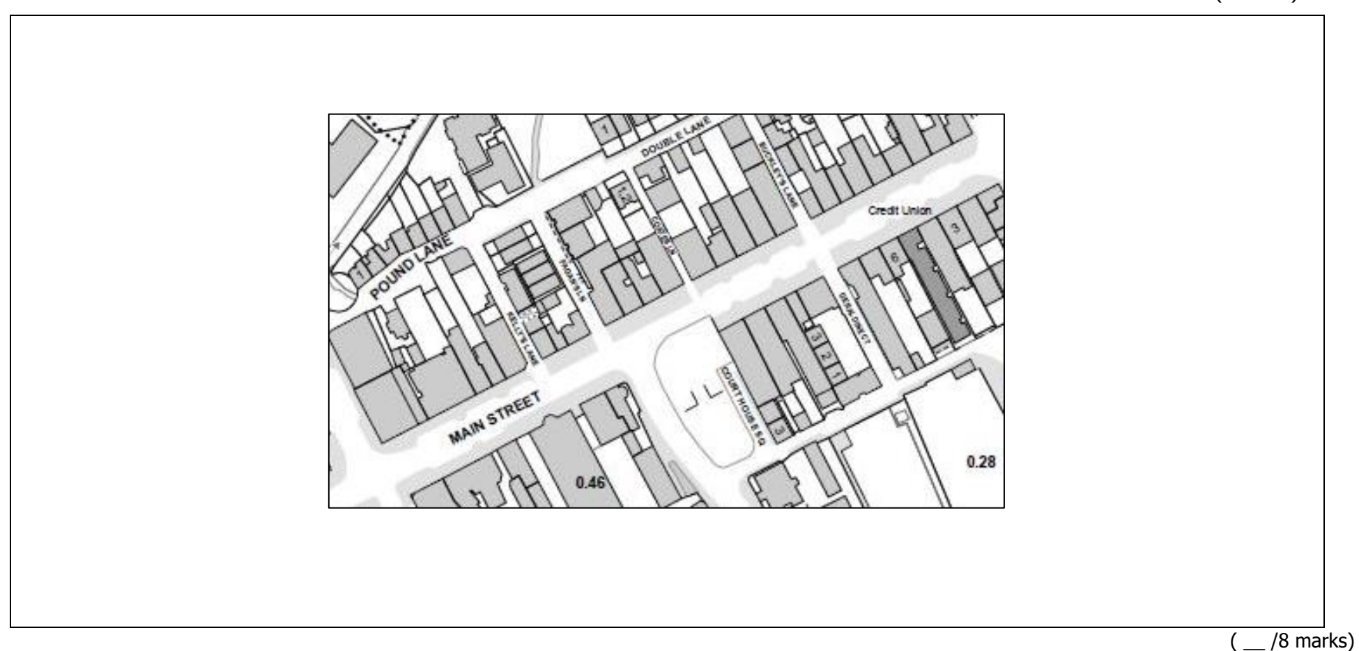
Task B3 Complete the table below to explain two ways in which you would change the street to make it more accessible for people.